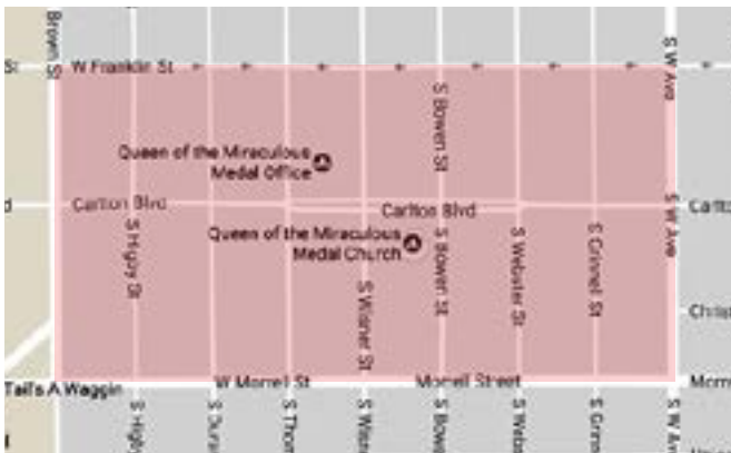
Spring Arbor Rd. store area

This year's prayer walk will take place on Sunday, May 5, 2019. The maps shown here indicate the area covered by our staff/ volunteers. If you would like to join us please call any of our locations. Any church is welcome to participate. To sign up for a walk area call Wendy Wight at 740-8444 or visit togetherdifference.org .