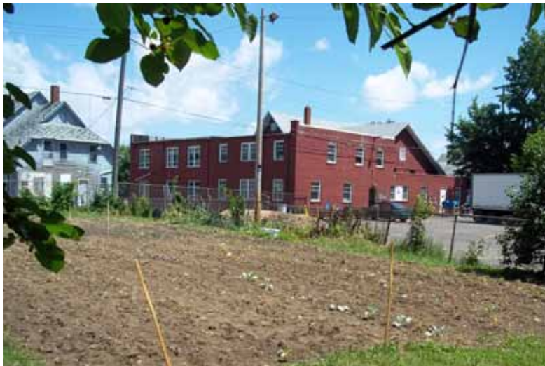
Our community garden next to the St. Vincent de Paul Center.

Thanks to a generous donor we are now growing many vegetables in a new garden. The lot next to our rear parking lot at the St. Vincent de Paul Center was purchased and will be used to provide many kinds of vegetables. They will be used for our community lunches and also to share with others who may need some help with food. Our garden will be a part of the Community Garden Tour on Friday, July 22, and be open from 9 am -7 pm with rain barrel and composter demonstrations at 12:00 and 3:00 pm. Stop by and see it!